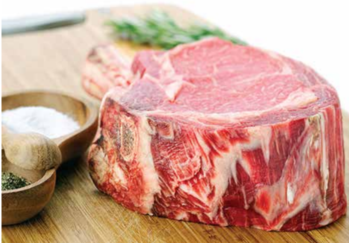
Frozen Boneless Rib Eye AUS