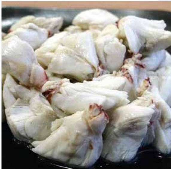
Meat Crab Collosal