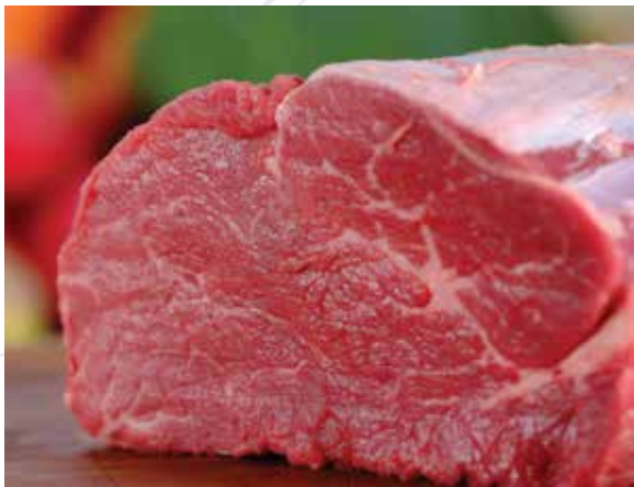
Boneless Tenderloin AUS

Prime Prime Prime Prime Prime Choice Choice No Roll Choice Choice Choice Choice Choice Choice No Roll