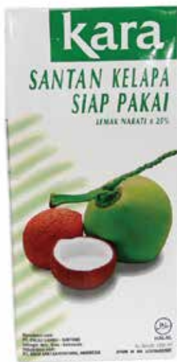
Kara 1000 MI