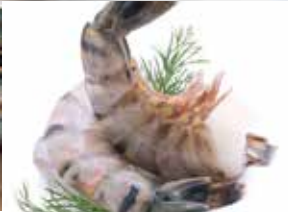
Peeled Tiger Prawn Product