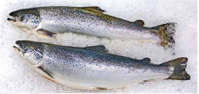
Norwegian Salmon Guttet