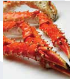
Alaska King Crab Legs