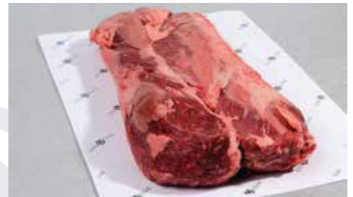
Hanging Tenden USA