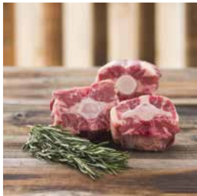
Oxtail Center Cut