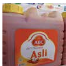
ABC Saus Sambal Asli